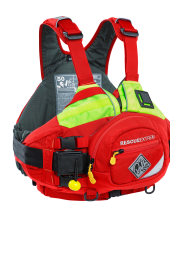
12135 Rescue Extrem