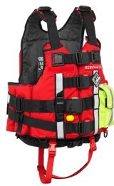
11621 Rescue 800