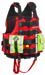
10392 Rescue 850

This advisory notice applies only to the following Palm Equipment Rescue PFDs made since 2018: