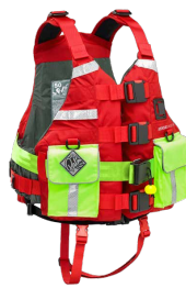
12355 Rescue Universal