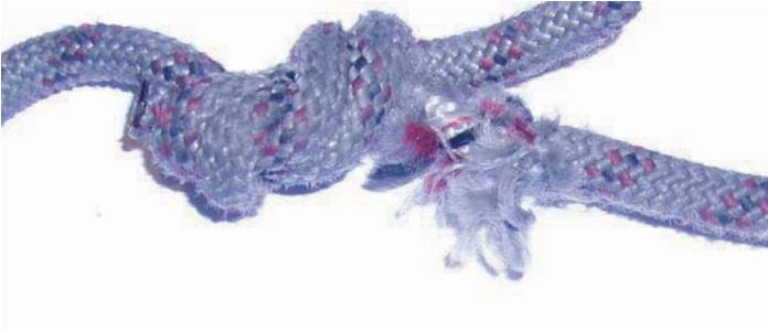
Fig.1: fibre breaks

The rope must be visually/manually checked along its entire length for the following wear appearance /defects / damage: