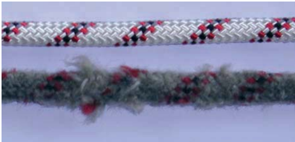
Fig. 2: Severe rope wear, wear with rope thickening

It is sensible to look for such rope properties (above items) during descending when the rope is sliding through the hand.